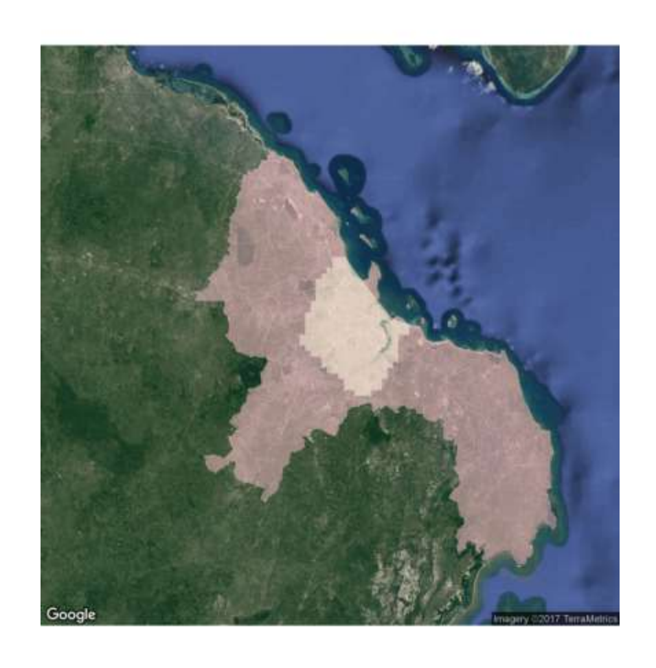
Figure 4: Dar es Salaam