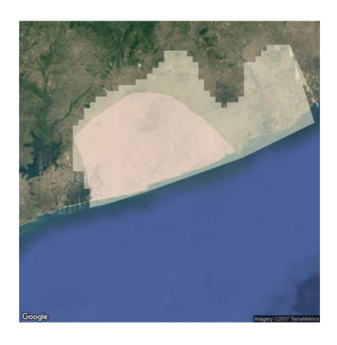
Figure 2: Accra