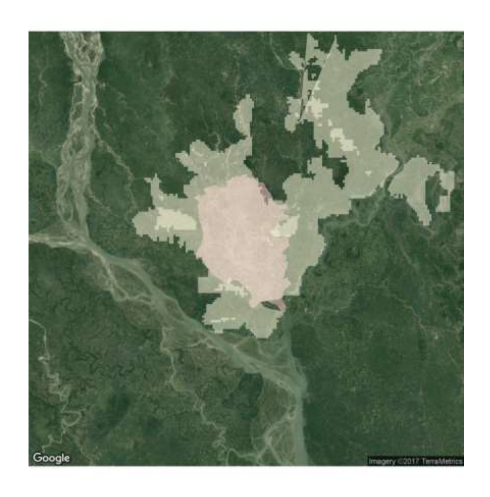
Figure 3: Dhaka